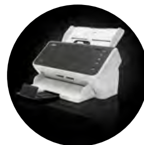
Alaris S2050/S2070 Scanners