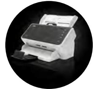
Alaris S2050/S2070 Scanners